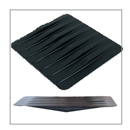
Cushion Rigidizer – lightweight and low profile